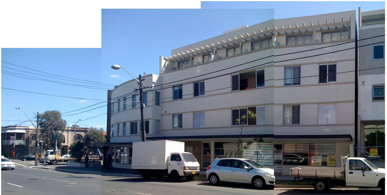
Regent Street façade.

4 x commercial, 13 x studios, 2 x 1 bed units, 26 x 2 bed units, 2 x 3 bed. 28 cars in secure basement