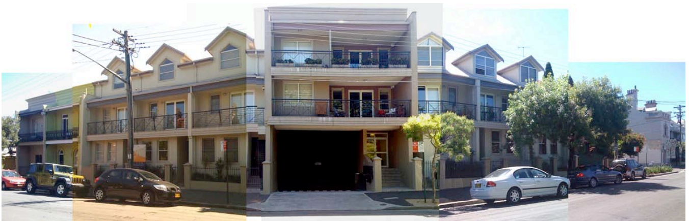
Pitt Street façade bookended by two groups of existing terraces.

4 x 2 bed units, 2 x 3 bed units, 22 x 3 bed townhouses. 40 cars in secure basement